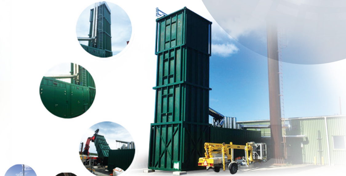
SMART DUO CABIN WITH VERTICAL SILO