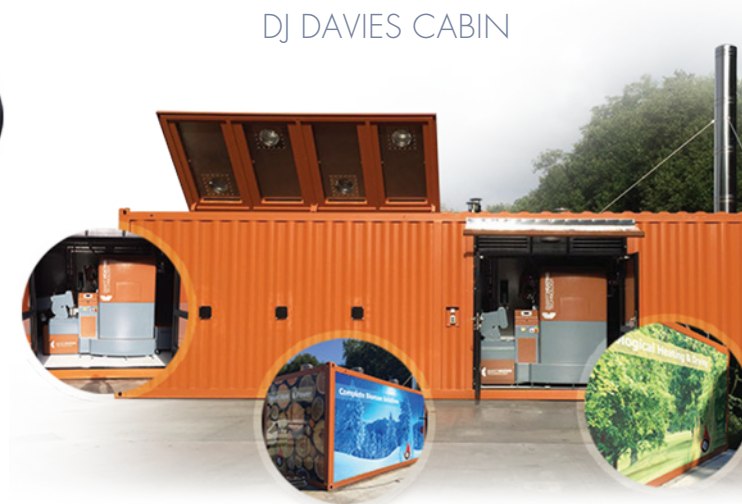
DJ DAVIES CABIN