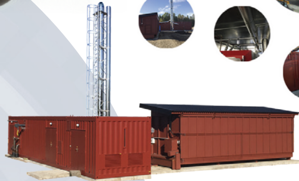
MAGNUM CABIN STORA SEGERSTAD