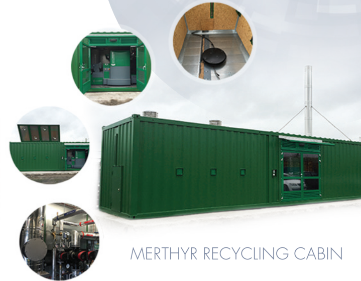
MERTHYR RECYCLING CABIN