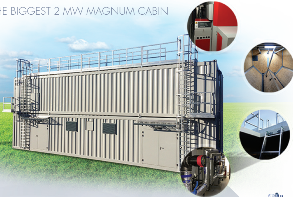
THE BIGGEST 2 MW MAGNUM CABIN