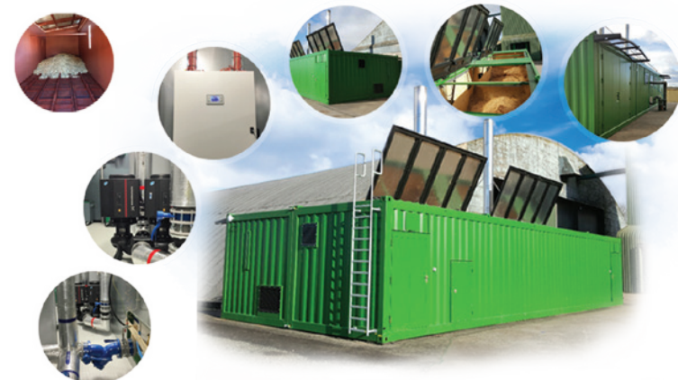
SMART MAGNUM CABIN 1 MW