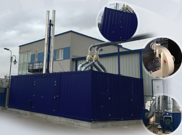
SMART MICRO CABIN