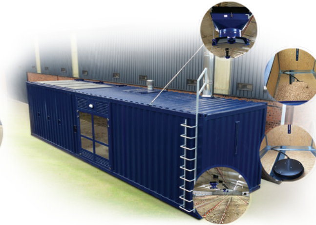
FINNIESTONE FARM CABIN