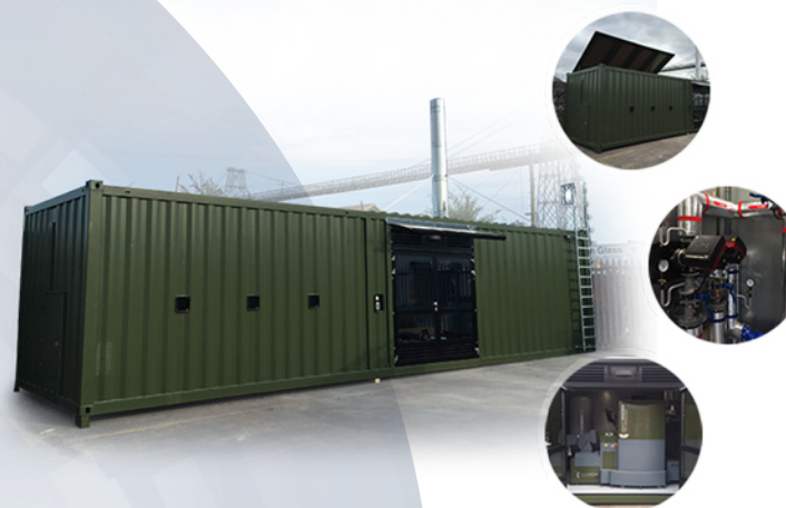
JUNK 4 JOY CABIN